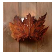
Beautiful new wall sconces